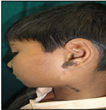
Image 2 Melanocytic Nevus