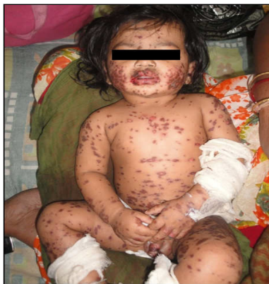
Image 10 Erythema Toxicum Neonatorum