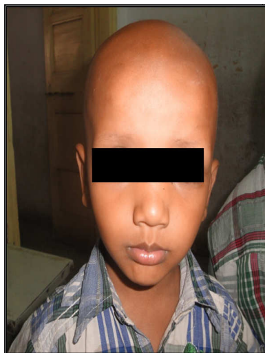
Image 7 Dermatomyositis Calcinosis Cutis