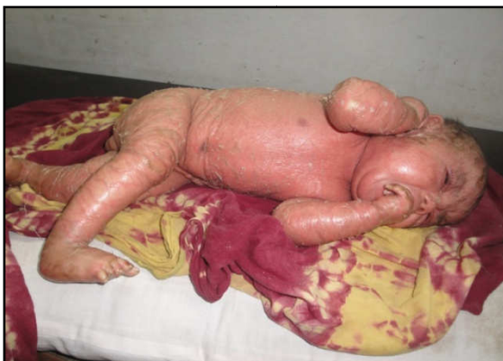
Image 5 Xeroderma Pigmentosa