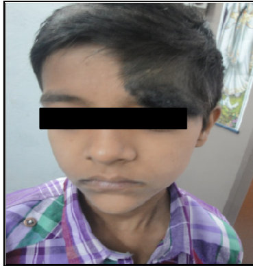
Image 3 Epidermolysis Bullosa