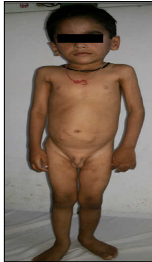
Image 8 Chronic Bullous Disease of Childhood