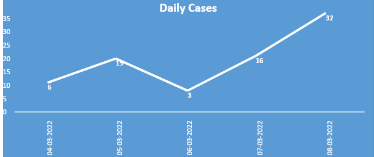
Figure 2: Daily Distribution of Cases.