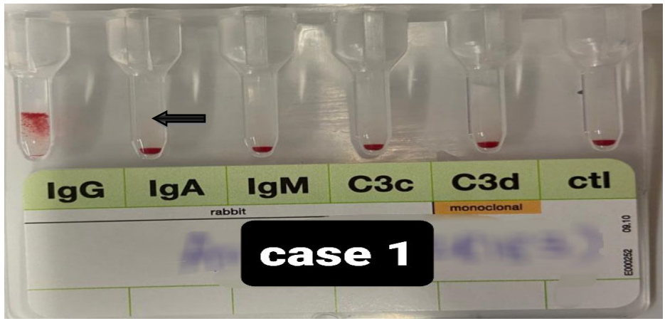
Figure 1 – Monospecific (column agglutination test) for CASE 1 – positive (IgG)

Request for transfusion of 3 units of packed red blood cells (PRBC) and 6 units of platelet concentrate was received. Blood grouping, antibody screening and cross matching were done by blood centre. Direct and Indirect Antiglobulin Test was found positive while doing work up. Monospecific DAT was positive for IgG ( Table1 ). To find compatible blood unit for this patient, crossmatch was done with 20 PRBC units out of which only 3 units were compatible. Out of them 2 units were transfused to the patient.