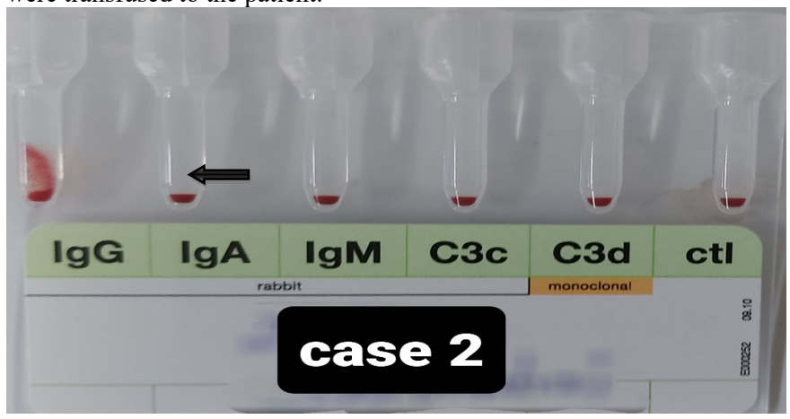
Figure 2 Monospecific (column agglutination test) for CASE 2 – Positive (IgG)

A 63-year-old male arrived at the Emergency department with sign and symptoms of giddiness, generalized weakness, low grade fever, cough, pedal edema, mild episodes of hematemesis and Melaena. On the day of admission, patient had low hemoglobin, platelet count and leukocytosis. Request for transfusion of 2 units of packed red blood cells and 10 units of platelet concentrate was received. Blood grouping, antibody screening and cross matching were done by blood centre. Direct Antiglobulin Test was positive while doing work up. In Monospecific DAT, IgG was positive (Table 2). To find compatible blood unit for this patient, crossmatch was done and 2 compatible units of packed red cells were transfused to the patient.