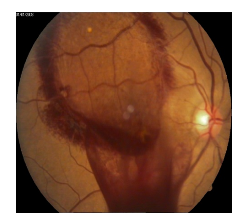
Figure.3:RE showing post hyaloidotomy displacement of sub-hyaloid haemorrhage inferiorly

Patient was diagnosed as RE Valsalva retinopathy. RE Nd:YAG laser hyaloidotomy was done. For this procedure APPA YAG LASER model 307 was used. After full pupillary dilatation and topical anaesthesia, a Goldmann contact lens was used to focus the Nd:YAG aiming beam and laser so that an opening in the posterior hyaloid membrane near the inferior edge of the subhyaloid haemorrhage could be performed, avoiding retinal blood vessels and fovea but keeping a reasonably sufficient underlying cushion of blood to shield the underlying retina. Nd:YAG laser power of 3.5mJ was used and total 4 shots were applied. Half hour post hyaloidotomy patient's vision in RE improved to 6/60 and best corrected visual acuity of 6/60 which did not improve with pin hole. Patient was then started on prednisolone acetate 1% eye-drops 4 times a day and tablet vitamin c 500mg 3 times a day, tablet prednisolone 40 mg once a day. On one week follow-up patient's vision improved to 6/12 unaided vision and best corrected visual acuity 6/6 on Snellen's chart. Fundus examination revealed regressing subhyaloid haemorrhage. (Figures 3 and 4)