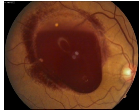
Figure.1: Right eye fundus showing sub hyaloid haemorrhage over macular area

A 32 year old female presented to us with sudden, painless loss of vision in right eye since 8 days. She had no other ocular history. Patient had an episode of vomiting and retching after which she developed diminution of vision. Patient had no systemic illness, no significant personal and family history. On examination, patient's unaided vision in right eye(RE) was counting finger one meter and 6/9in left eye (LE) on Snellen's chart. Best corrected visual acuity in RE counting finger one meter, in LE 6/6. The anterior segment was within normal limits. Fundus examination of RE by indirect ophthalmoscope revealed a sub-hyaloid haemorrhage over posterior pole involving the macular area approximately 8 – 9 disc diameter (DD) in size, 1 DD temporal to margin of disc (Figure.1).